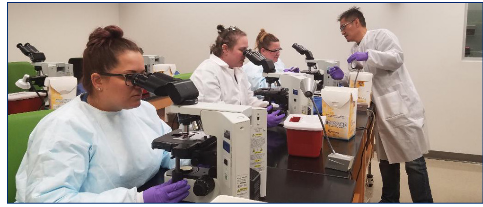
Students participate in hands-on activities in the bioterrorism and chemical threat workshop.

Submitted by: Patty Atwood, Laboratory Improvement Coordinator