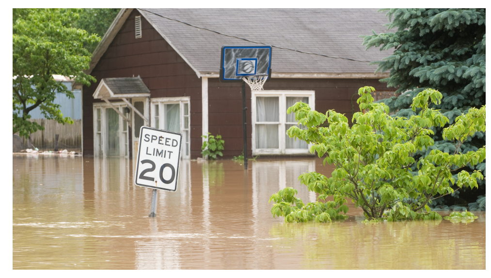
Flooding from a hurricane greatly impacts well water quality.

As expected, following flooding of this nature, the overall results for these samples show a higher level of contamination than routine well water samples. From January-September preceding Hurricane Florence, 73.7 percent of the private well samples tested were absent of both total coliform and E. coli , 24.2 percent had total coliform present but no E. coli , and 2 percent indicated the presence of both total coliform and E. coli . For the hurricane samples, 55.9 percent were absent for