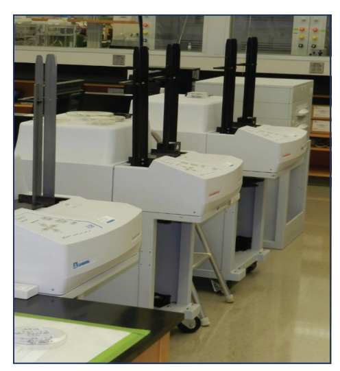
Tennelec XLB-5 Gross Alpha/Beta Counters (2902)

Tritium (H3) in water, and Nickel-63 (Ni-63) leak-test analyses of Gas Chromatography devices with Electron Capture Devices (ECDs).