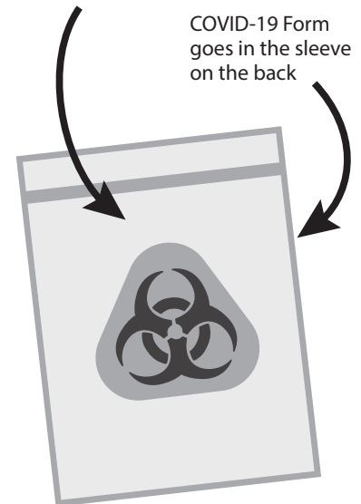
COVID-19 Form goes in the sleeve on the back